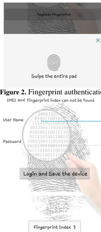
Figure 2. Fingerprint authentication