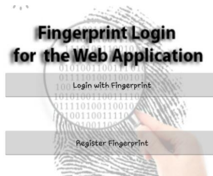
Figure 1. Login screen of the fingerprint web login authentication program

1) Initially, the user is presented with the screen shown in Figure 1. The user is expected to login with fingerprint authentication as shown in Figure 2. If there is no fingerprint record on the mobile device, registration of the user's fingerprint is required. After fingerprint registration, the fingerprint verification is requested from the user again.